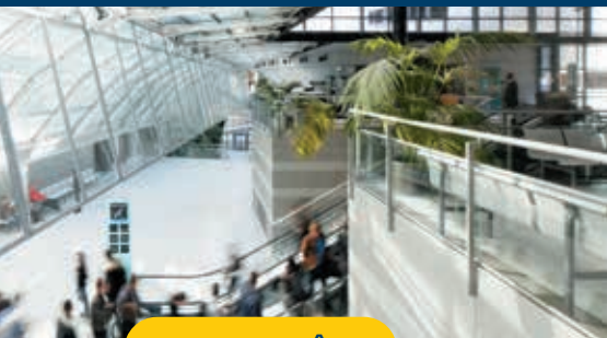
CAMPUS DU PÔLE