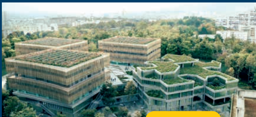
CAMPUS DU PARC