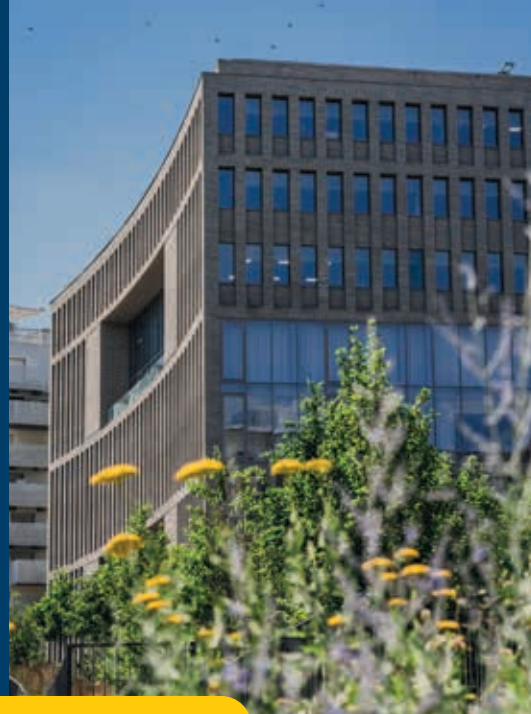
CAMPUS DE L'ARCHE